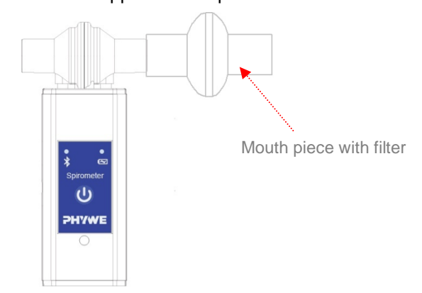
Fig. 2: Connecting the mouthpiece with filter

Attach the supplied mouthpiece with filter to the sensor.