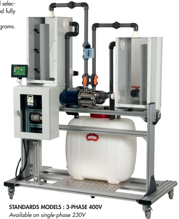
STANDARDS MODELS : 3-PHASE 400V