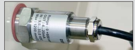
ref. HYDRO-NIV INCLUDING ON HYDRO-1 AND HYDRO-2