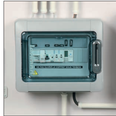
Modular electrical panel