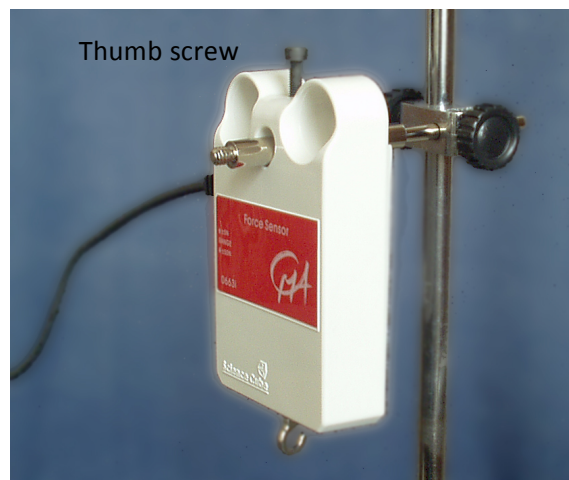
The Force sensor can be hold by hand or mounted on a ring stand.